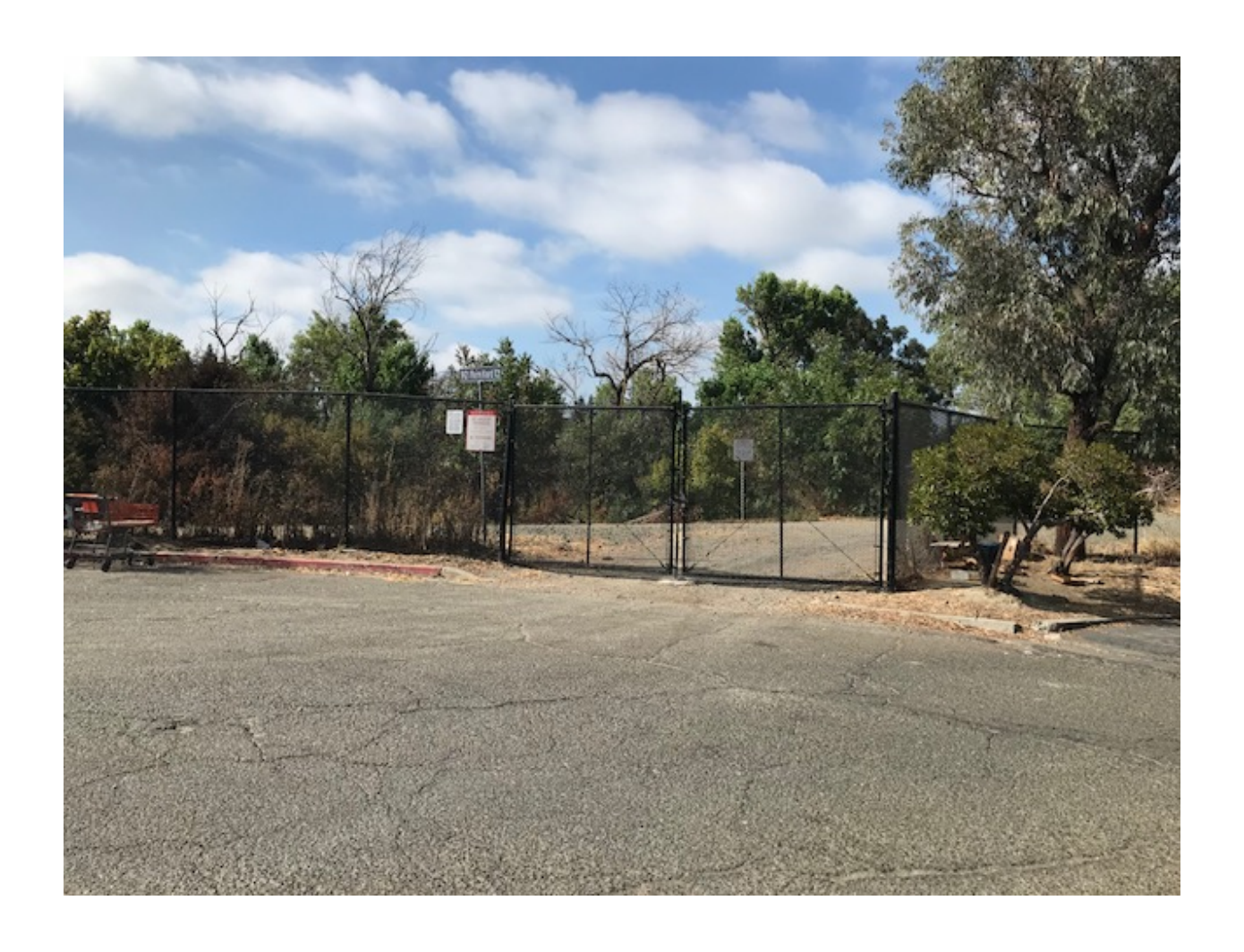
Entrance to access road on North bank at end of Remillard Ct.