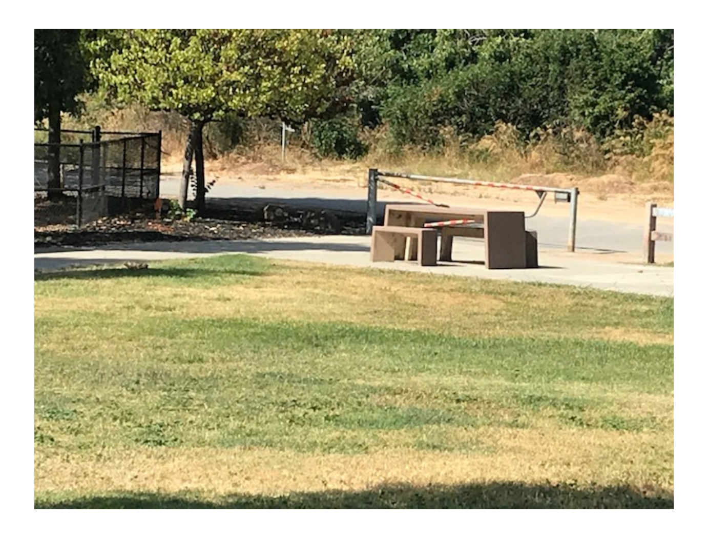
Trail area adjacent to Olinder Park east bank