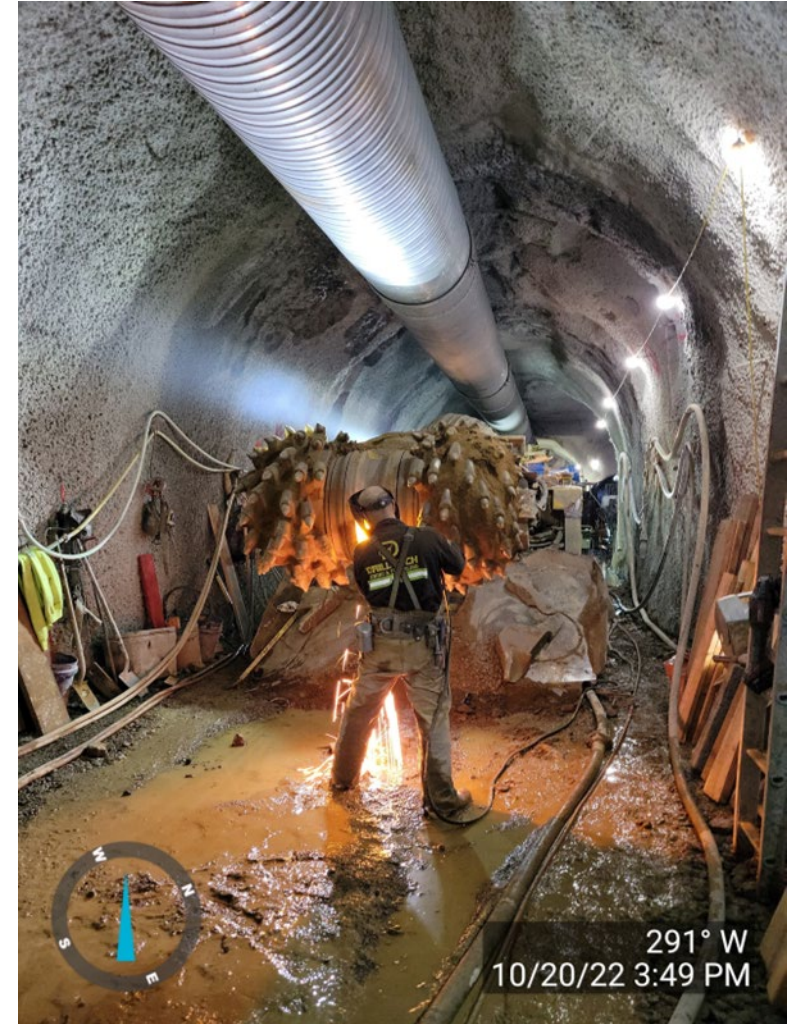
Nob Hill High-Flow Tunnel Road Header