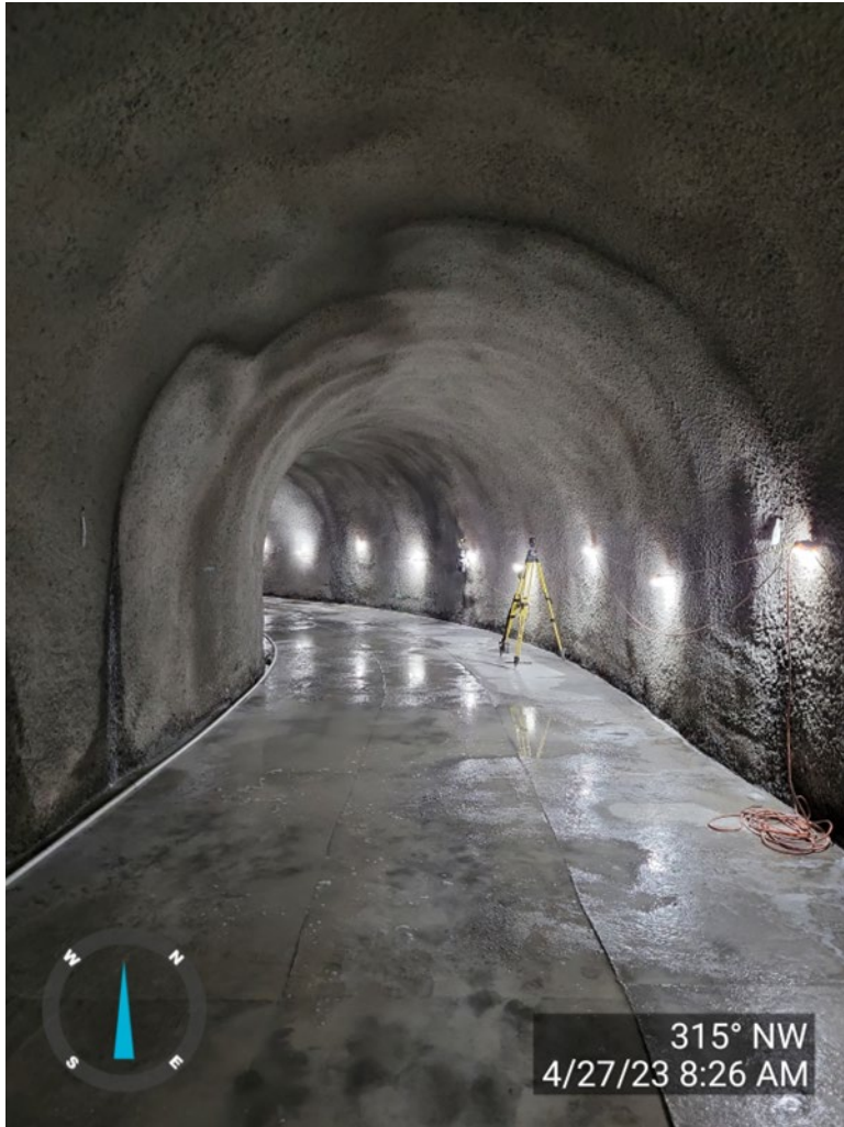
Completed Nob Hill high-Flow Diversion Tunnel