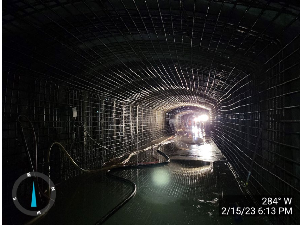
Nob Hill High-Flow Diversion Tunnel Transition Reinforcement