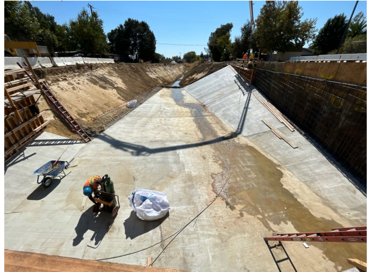
Concrete lining at Ciolino Avenue at confluence with existing West Little Llagas Creek