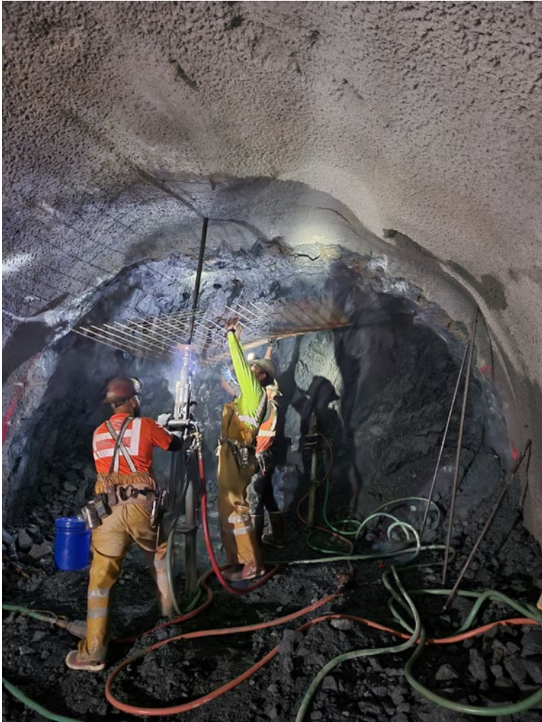
Nob Hill High Flow Tunnel Setting Reinforcement