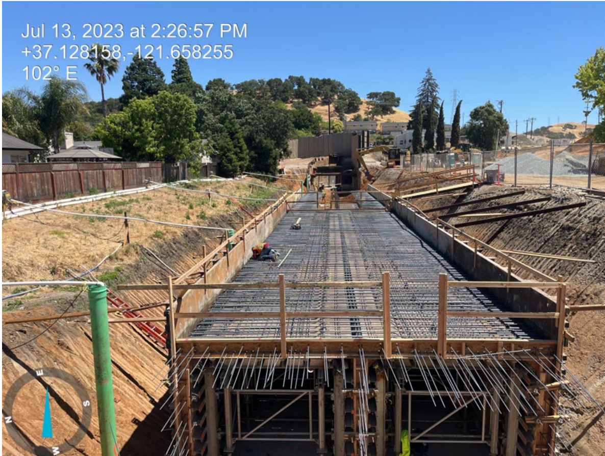
Reinforced Twin Box Culvert construction between W. Main Ave and Warren Ave (Looking South/Downstream)