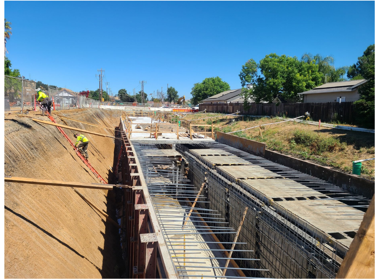
Reinforced Twin Box Culvert construction between W. Main Ave and Warren Ave (Looking North/Upstream)