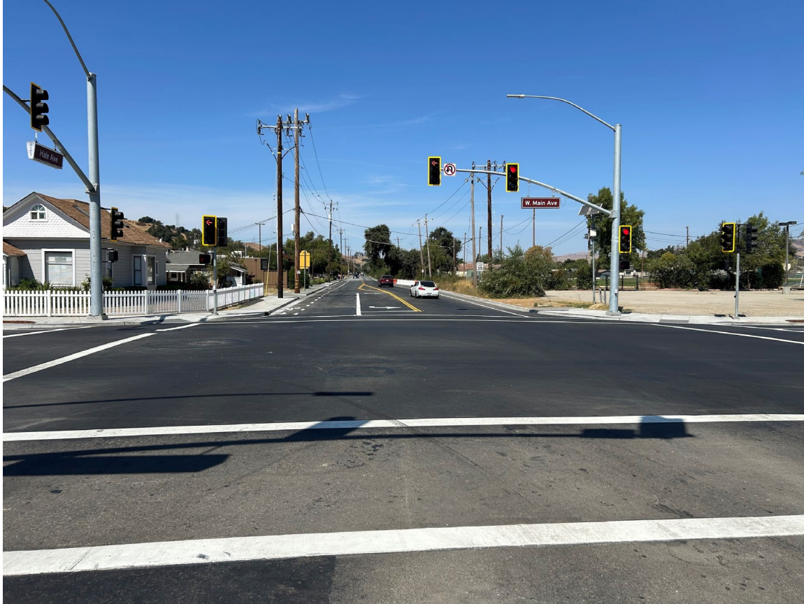
Completed W Main Ave & Hale Ave Intersection with underground Reinforced Twin Box Culvert