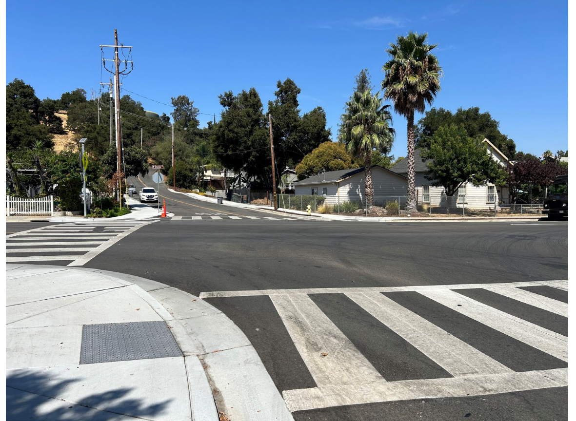
Completed W Dunne Ave and Del Monte Ave Intersection with underground Reinforced Twin Box Culvert