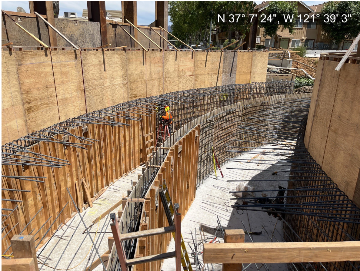
Reinforced Twin Box Culvert construction near Ciolino Ave at confluence with existing West Little Llagas Creek