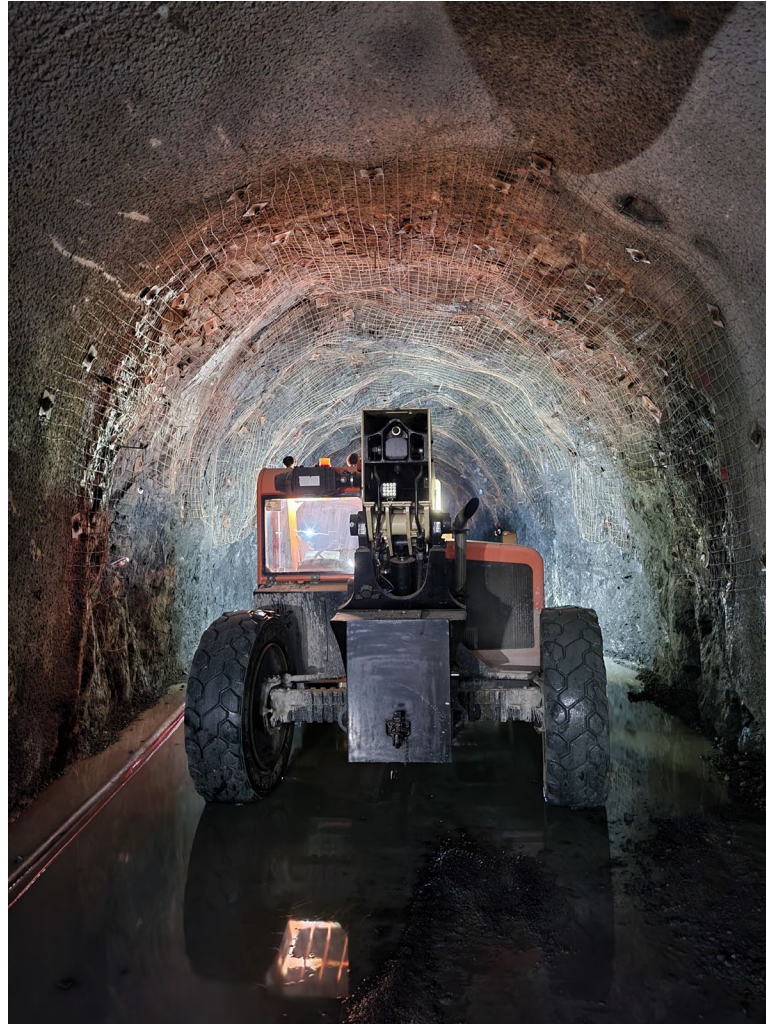
Nob Hill High-Flow Diversion Tunnel Reinforcement