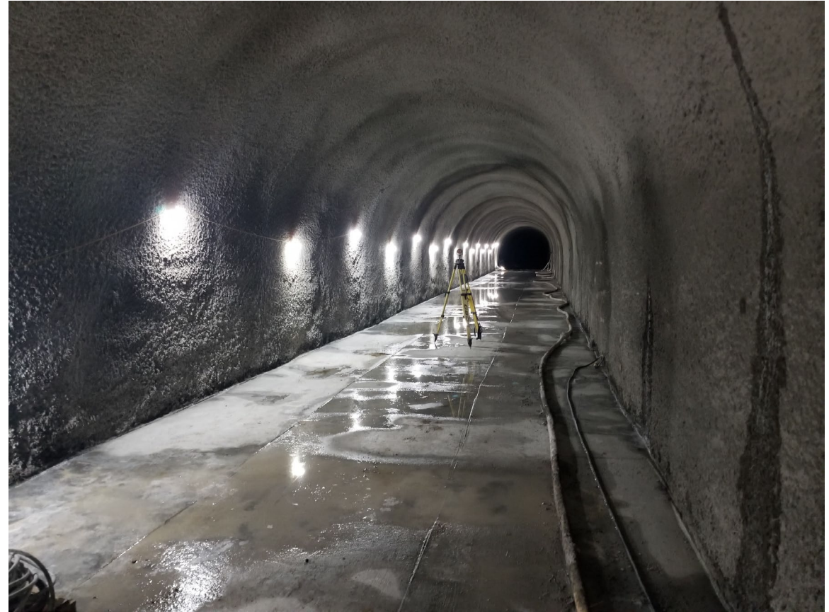
Completed Nob Hill High-Flow Diversion Tunnel