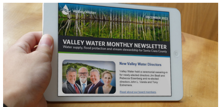
The Valley Water monthly newsletter was released on Dec. 29 and featured the newly-elected and re-elected board members.