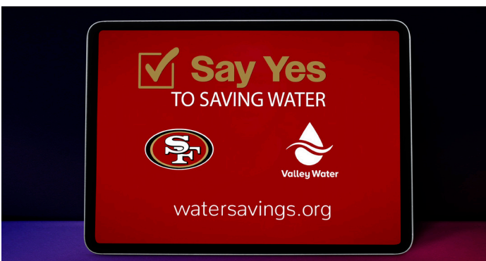
Staff produced a Say Yes to Saving Water video in partnership with the 49ers.

Our water conservation campaigns are continuing with tips for saving water and messaging on dialing back on irrigation during the winter. We are also promoting our landscape, irrigation and graywater rebates, outdoor water surveys and e-cart. A campaign focused on commercial watering rules ran through December with ads on audio and video streaming platforms, digital, social, newspapers and supermarket shopping carts.