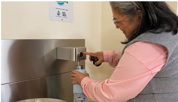
A community member refills a reusable water bottle at the Valley Water grant-funded refill station in Saint Elizabeth Catholic Church's Parish Ministry Center.

Valley Water closed a $5,000 Refill Station Grant Project with Saint Elizabeth Catholic Church in Milpitas. The grant funded the addition of a water refill station to an existing water fountain in the church's Parish Ministry Center. The refill station serves community members during large events where the church previously distributed disposable water bottles, as well as community members who utilize the church's charity services through the Society of St. Vincent de Paul.