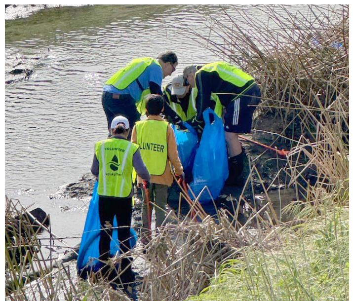
Volunteers from Palo Alto Foundation Medical Group work together to remove trash from the banks of San Tomas Aquino Creek in Santa Clara.