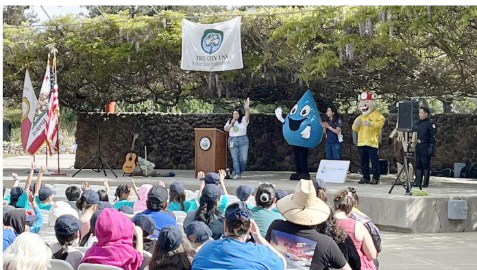
Students take the water conservation pledge at the City of Santa Clara's Earth Day and Arbor Day Celebration.