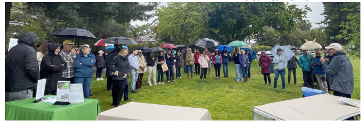
Community members celebrate the 500th tree planted by GreenTown Los Altos during the Arbor Day Celebration event in Los Altos.

On April 25, Valley Water attended the Los Altos Mountain View Community Foundation's Arbor Day Celebration Event in Lincoln Park in Los Altos. The event celebrated the organization's tree restoration and native planting efforts which was partly funded by a $5,000 Safe, Clean Water Mini-Grant. There were approximately 55 attendees, including Los Altos Mayor Pete Dailey and County Supervisor Margaret Abe-Koga.