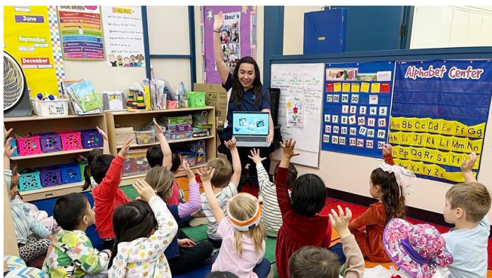
Students participate in the classroom lesson Blue Hen at Action Day Schools in Mountain View.