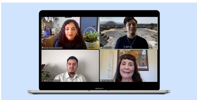
Panelists and moderator during the Hispanic/Latinx panel.