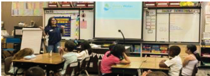
Students at Country Lane Elementary school learn about Valley Water's mission to provide safe and clean water, flood protection, and healthy creeks and ecosystems to Santa Clara County.

In May, staff engaged youth from kindergarten through fifth grade through classroom lessons and assemblies. Students at Capri, Country Lane, and Nimitz elementary schools explored the life cycle and challenges of the steelhead trout through the interactive Steelhead Journey lesson and game. Students learned how Valley Water protects steelhead habitat and discussed everyday actions they can take to help protect this local species. In the Water We Share lesson, students from Glen View Elementary created posters promoting purified water to demonstrate their understanding of its importance and benefits.