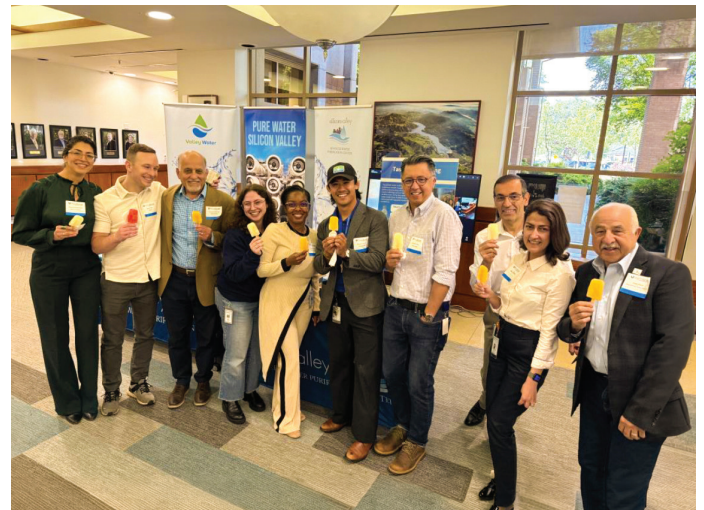
Local water agencies, consultants, and regulators are welcomed with purified water popsicles at the WaterReuse Association Northern California Chapter meeting in San José.

In May, 152 attendees visited the Silicon Valley Advanced Water Purification Center for an in-person tour, including youth students and educators, water industry proponents, business professionals, and members of Valley Water's Water 101 Academy. Altogether, staff distributed 305 bottles of purified water for outreach.