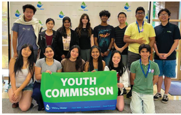
Valley Water Youth Commission holds its 4th Quarterly Meeting at the board room.

In May, the Youth Commission held its fourth quarterly meeting, during which each subcommittee provided updates on the completion of their respective projects. The meeting also included a graduation ceremony recognizing 11 Youth Commissioners for