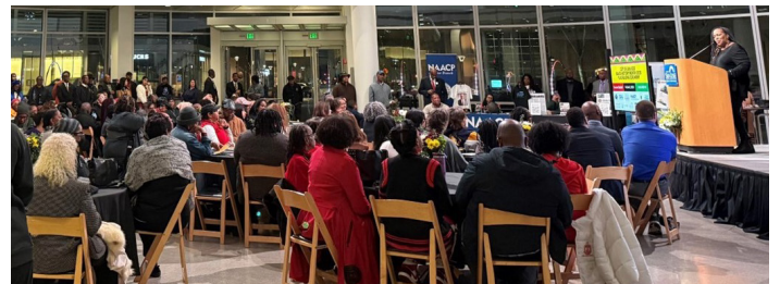
February 7: Standing room-only at the City of San José's Black History Month event.