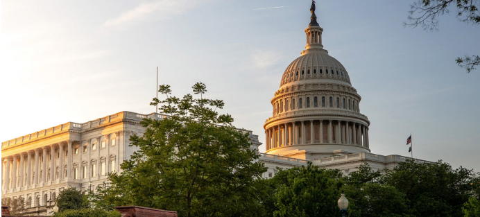
Capitol Building in Washington, D.C.