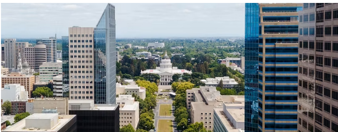
State Capitol and Downtown Sacramento, California.