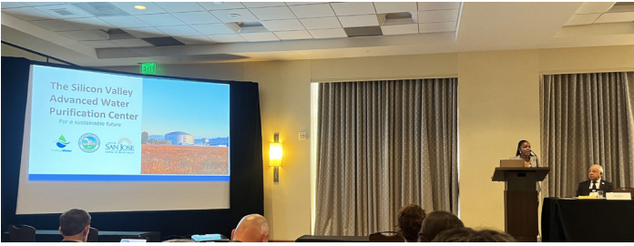
Staff presented Valley Water's tour program and outreach strategies at the 2024 California WaterReuse Conference.