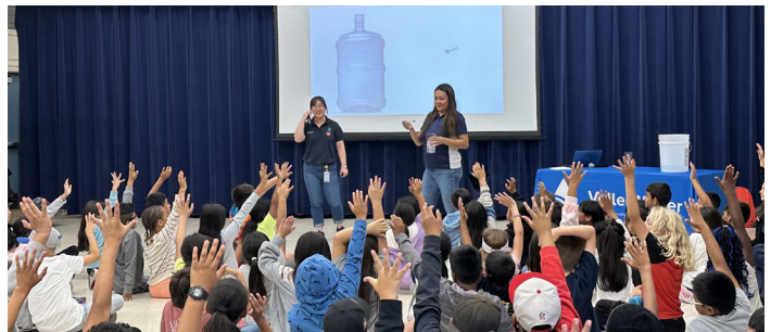
Students at Hughes Elementary in Santa Clara volunteer for a demonstration during an assembly on how Valley Water manages our water supply.