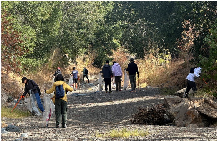
Volunteers pick up litter along waterways throughout Santa Clara County during California Coastal Cleanup Day.