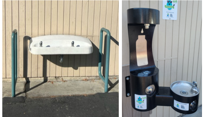
Valley Water's Refill Station Grant helped Pearl Zanker Elementary School upgrade its water fountain to a modern refill station.

Closeouts: In fiscal year 2024, Valley Water awarded the PTA California Congress of Parents Teachers and Students, Inc. a refill station grant to replace an existing water fountain at Pearl Zanker Elementary School in Milpitas with a combination water fountain/refill station. The new station serves over 600 students and encourages the use of reusable water bottles.