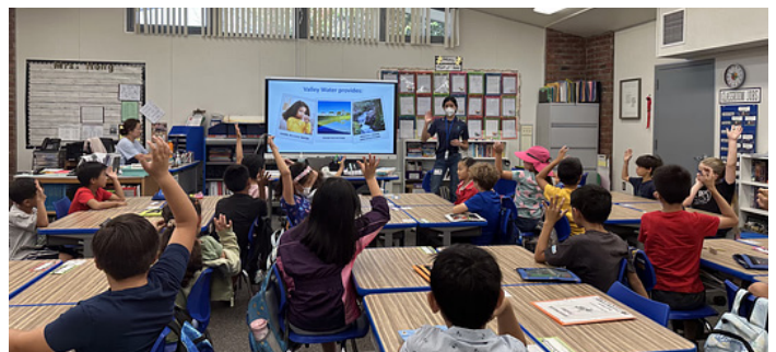
Students at Noble Elementary School in San José guess how many people live in Santa Clara County while learning about how Valley Water serves the community.