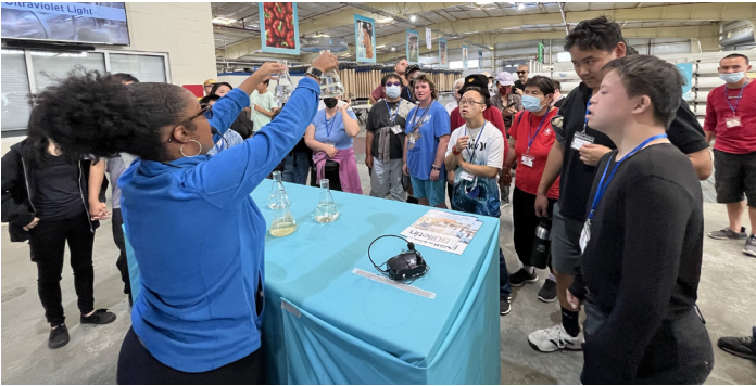
Members of Friends of Children with Special Needs observe various water samples during a Purification Center tour.