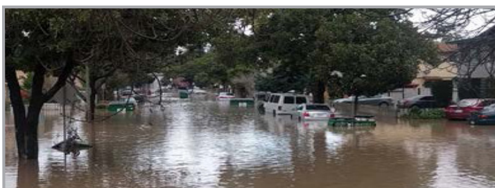
Rock Springs neighborhood, February 21, 2017 Coyote Creek flood event