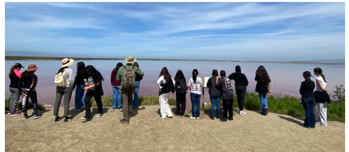
Students from Franklin Elementary School learn about the ecology of salt ponds at Alviso Marina County Park in San Jose.

On April 17, Marshmallow Minds hosted its Migratory Birds STEAM Design Program field trip at Alviso Marina County Park in San Jose. This field trip was part of their Safe Birds, Safe Water Project, which was funded by a $58,880 Safe, Clean Water F9 Standard Grant. The event included a nature hike and garden restoration with Franklin Elementary School sixth graders and was co-hosted by the San Francisco Bay Bird Observatory.