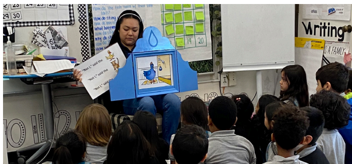
Students at St. John School in Milpitas listen to the story of the Little Blue Hen to discover ways to conserve water.