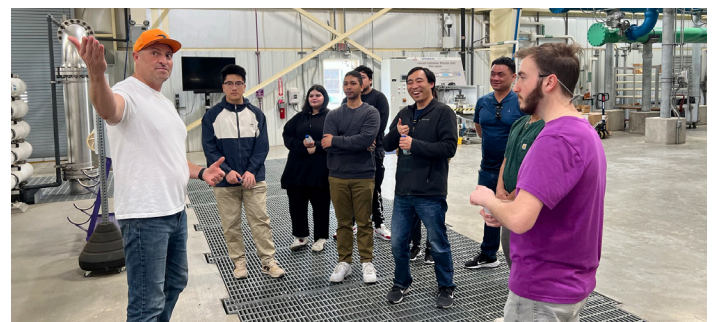
Purification Center staff answer technical questions from members of the American Institute of Chemical Engineers during a tour.