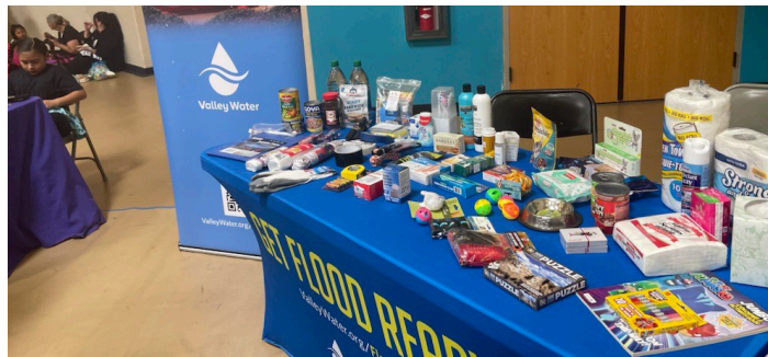
Valley Water provided flood-preparedness materials at the Eggstravaganza Family Event in San Jose.

In April, Valley Water participated in two emergency preparedness events to share the “Get Flood Ready” message. Staff hosted a booth at the Eggstravaganza Family Event organized by the Strong Neighborhood Initiative Program Mayfair Neighborhood Advisory Council in San Jose, which had more than 350 attendees. Valley Water also participated in an educational workshop with 40 attendees at The Links, Incorporated “Emergency Preparedness: Safety Now, Peace Later” event at the African American Community Service Agency in San Jose.