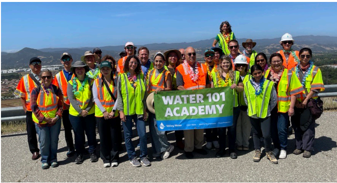
During their infrastructure bus tour, the Water 101 Academy Program visited multiple sites, including the Anderson Dam Seismic Retrofit Project.