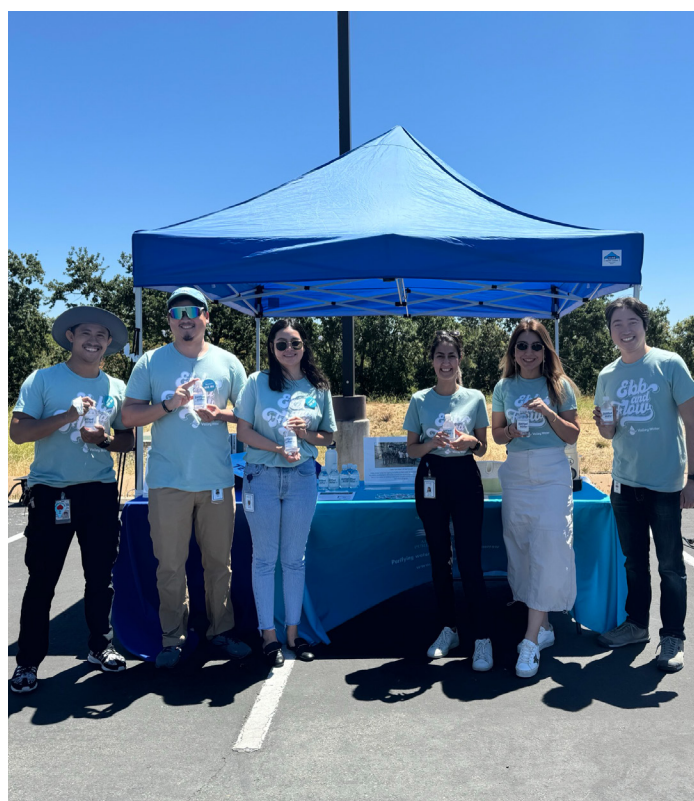
Water Supply Outreach and Recycled and Purified Water staff handed out purified water demonstration bottles to over 200 employees at the Live Town Hall event on June 27