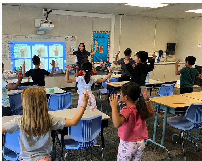
Students at the YMCA Hughes Summer Program in Santa Clara use movement to remember landforms and bodies of water found in watersheds.