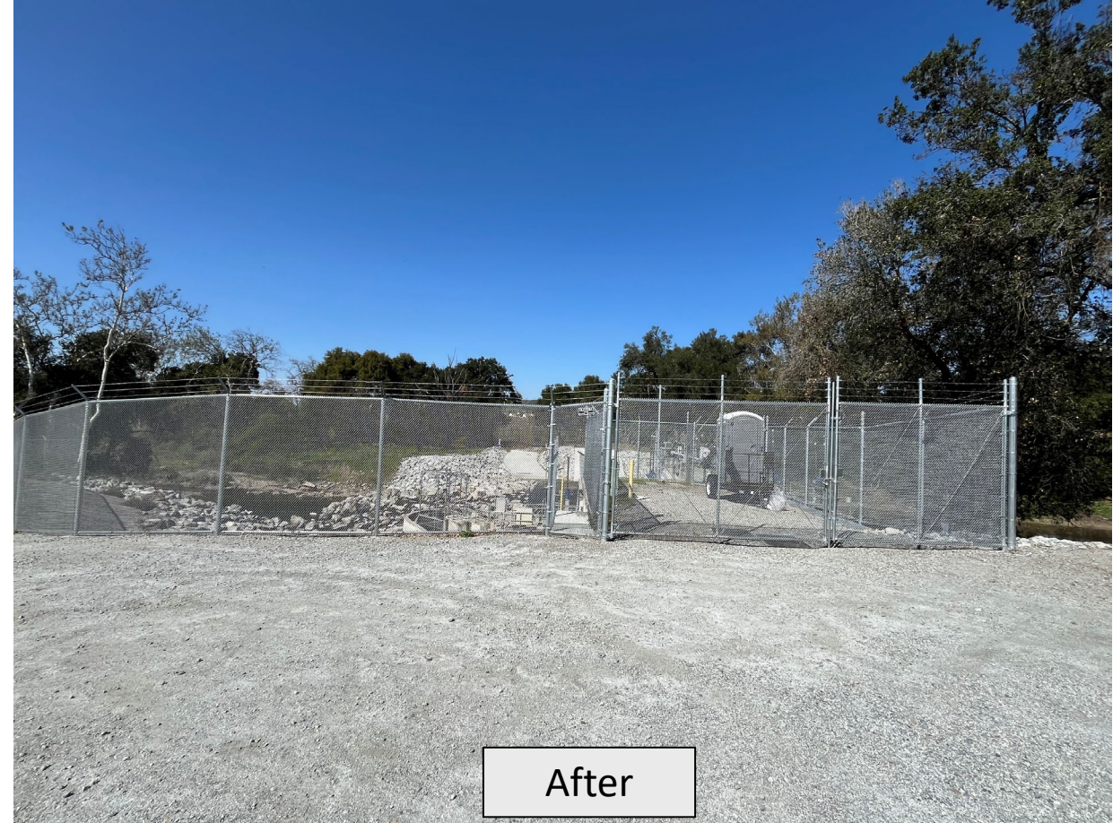
Access Gate to Dam and Fish Ladder Structure