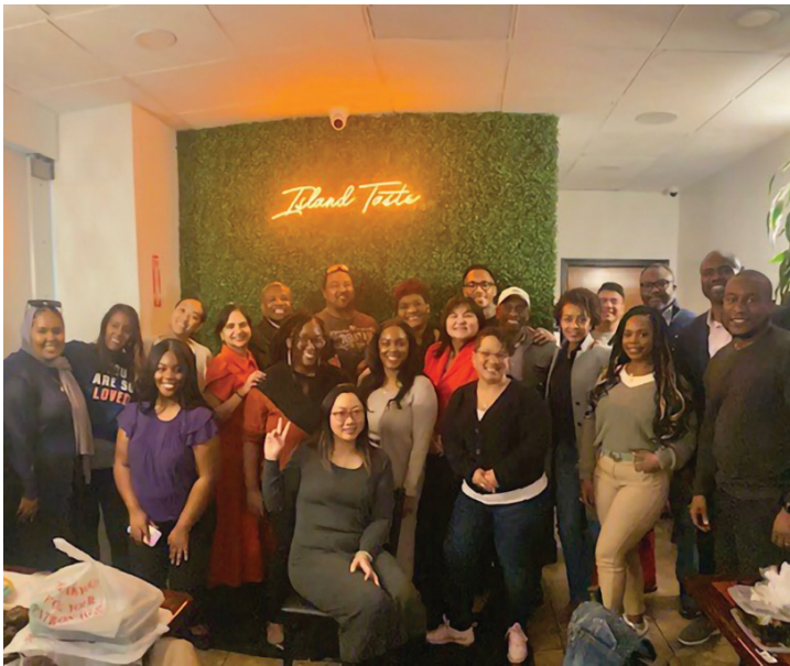
2024 ABE Black History Month Employee Social

The observance of Black History Month, also known as National African American History Month, started at Kent University in 1971. It was first proclaimed as a national observance by President Ford in 1976. Black History Month was created to highlight the contributions of African Americans to the United States throughout history. This year the theme is “African Americans and Labor,” focusing on the intersection of working and the collective experience of Black people throughout history.