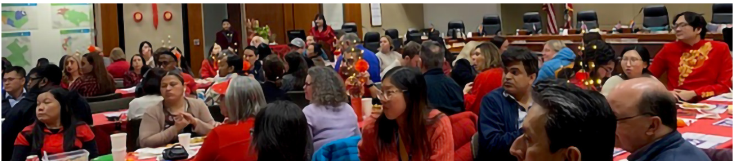
2024 APRG Lunar New Year Celebration

^ Day may vary by 1-2 days based on astrological factors (e.g., sighting of the first moon)