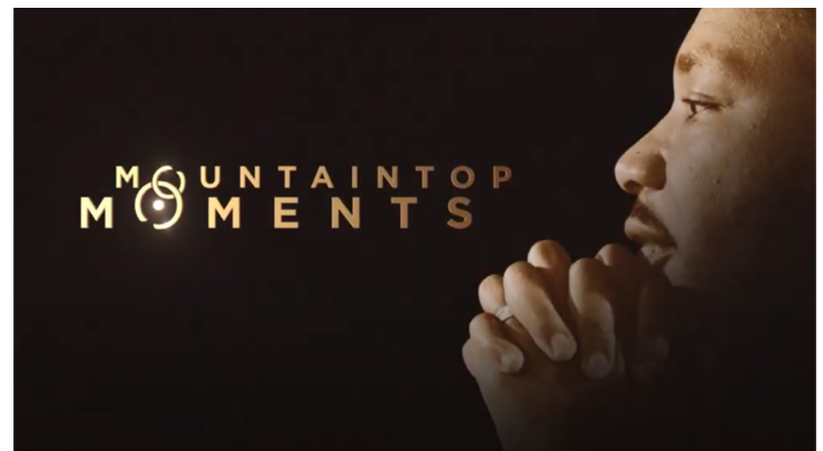
History Channel short video honoring Martin Luther King, Jr.