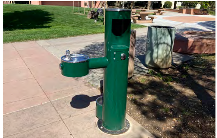
A refill station grant funded the new multifunction refill station at Morgan Hill Community and Cultural Center.

In addition, Valley Water awarded two new refill station grants. The first was to the City of Morgan Hill for a second refill station at the Community and Cultural Center. This refill station will be located indoors near the restrooms, providing convenient access for individuals using the meeting and event rooms. The second grant was awarded to MHOSC, the nonprofit organization operating the Morgan Hill Outdoor Sports Center, for a second refill station at that facility. The station will be installed near the soccer turf, close to the bleachers and parking lot, ensuring easy access for athletes, spectators, and visitors.