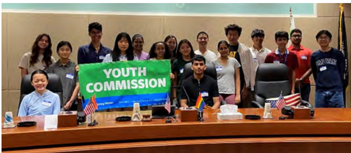
The Valley Water Youth Commission stands together, ready to represent the voices of youth across Santa Clara County at the first quarterly meeting of FY26.