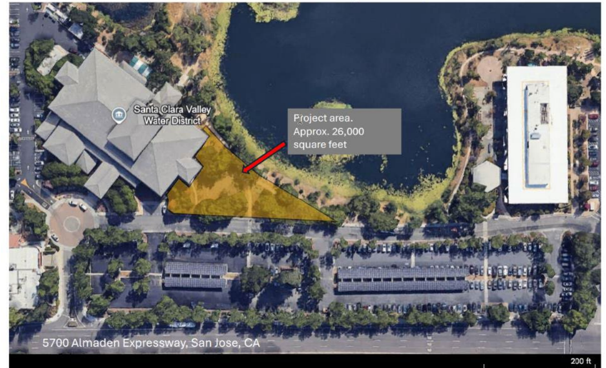
Valley Water Demonstration Garden Project Map