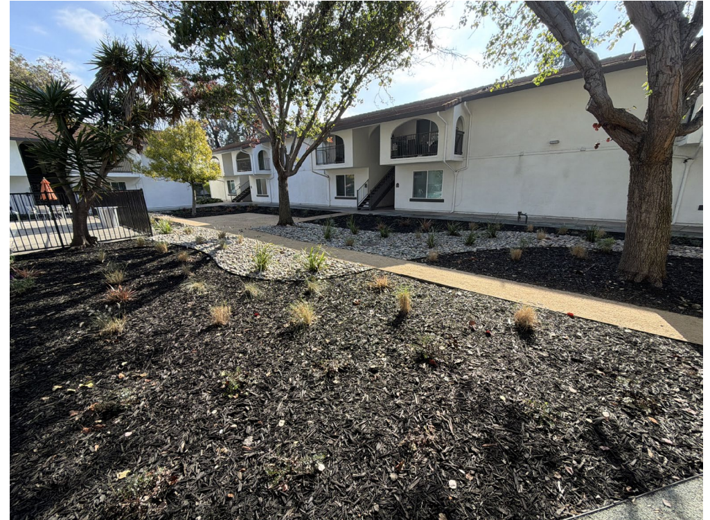
21,000 square feet of lawn conversion project featuring climate-appropriate, low-water use landscape.

Utilize remaining funds for increased marketing to commercial, institutional, and multi-family sites