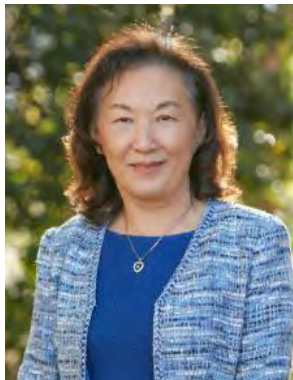
Nai Hsueh District 5