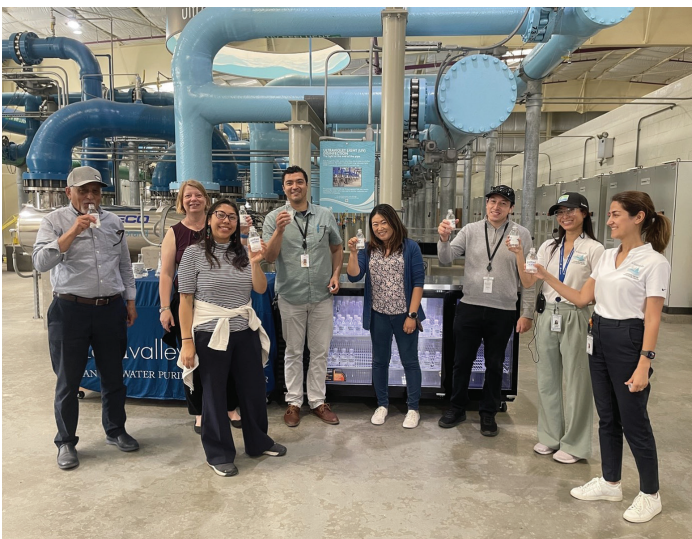
August 13: Tour attendees from San Jose Council District 2 and Valley Water staff sampling bottled purified water.