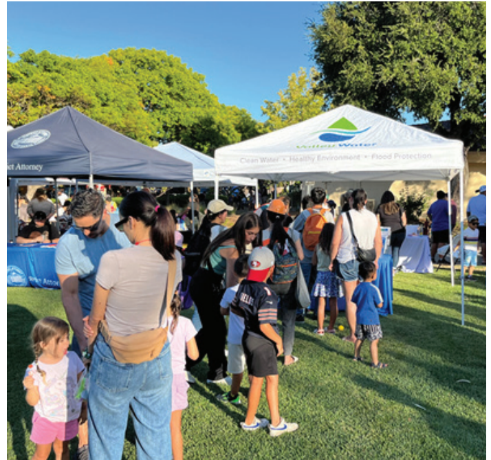
August 5: The line of people eager to hear about Valley Water programs and resources at National Night Out.

On August 5, Valley Water hosted two National Night Out booths – the City of Morgan Hill's NNO at their downtown Civic Center Plaza along with Sea Martins Lions Club NNO in San Martin. This event is an annual community-building campaign that promotes police-community partnerships and neighborhood camaraderie. Participation in these events allowed Valley Water to engage with the community about flood preparedness, water policy issues, unhoused creek cleanup efforts, and the water conservation online shopping cart.