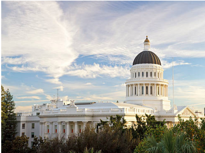
California State Capitol in Sacramento.