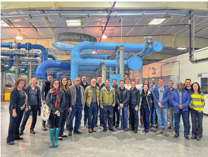
Staff from City of San José and San Jose Water attended a private tour of the Silicon Valley Advanced Water Purification Center.