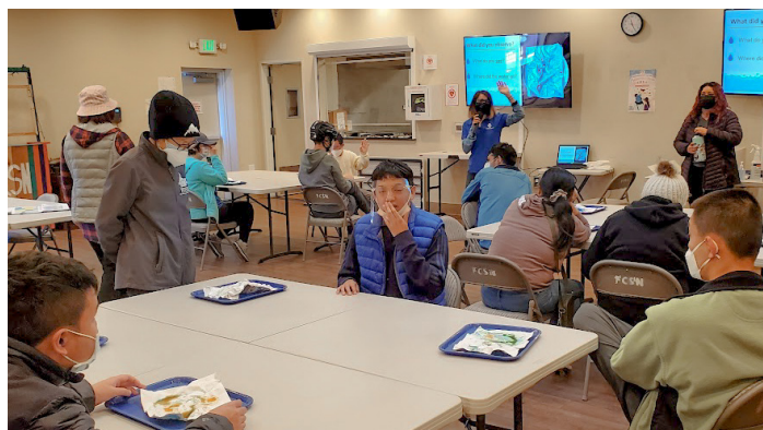
Clients at the Family of Children with Special Needs Center (FCSN) create watershed models and learn about watershed stewardship and water conservation.

In November, the Education Outreach Program (EO) supported 66 educators and 1,204 students through 23 school presentations and three tours at Edith Morley Park and Alamos Outdoor Classrooms. EO staff also presented “Watershed Maps” to 50 clients at the Family of Children with Special Needs Center (FCSN) in San José and engaged with 29 students and family members during two library programs at Evergreen and Carnegie Branch Libraries. In a continued collaboration with the City of San José’s Walk n’ Roll program, EO raised drought awareness during two school assemblies to 480 students at Alex Anderson Elementary. EO also presented water conservation and stewardship activities to Girl Scout Troop 60039, supporting their “Wonders of Water Journey.”