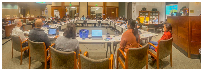
Youth Commissioners and staff met in person for the second quarterly committee meeting.

On November 29, the Job Shadowing and Mentorship working group held its first meeting to commence planning for the upcoming virtual Job Shadow Day on February 23, 2023.