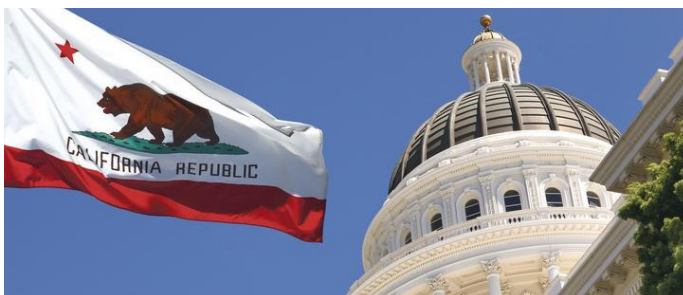
California State Capitol