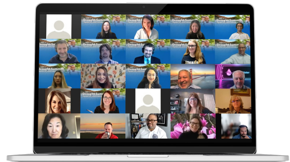
Drought Summit 2021