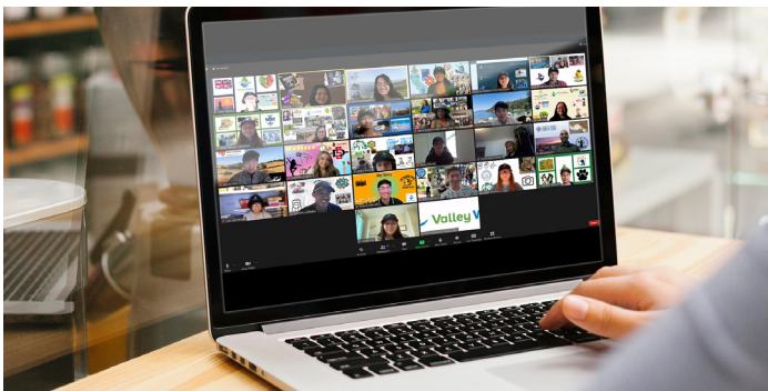
Youth Commission Retreat on October 2.