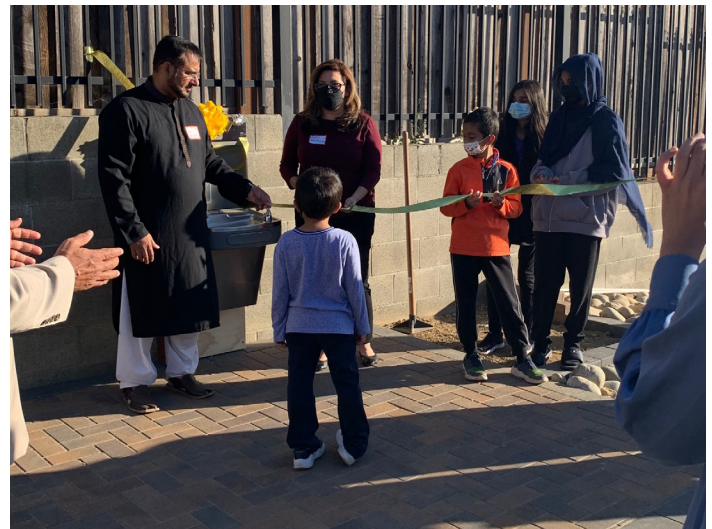
Evergreen Islamic Center and community members celebrate the unveiling of the newly installed outdoor drinking water and bottle filling station.

Evergreen Islamic Center's Ribbon-cutting event for their Drinking Water Stations Project: The Project, funded by a $5,000 Valley Water mini-grant, included the installation of two bottle filling stations located inside and outside of the faith-based facility. The Evergreen Islamic Center (EIC) welcomes 50,000 visitors annually and hosts inter-faith sessions and various community and educational events throughout the year. EIC Board members hope that the drinking water stations will eliminate single-use plastics and paper cups at their facility and will track this reduction as part of their project outcomes.