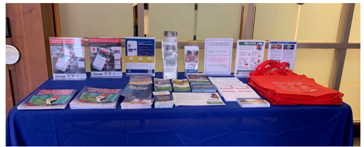
California Flood Preparedness Week October 23-30, 2021

California Flood Preparedness Week (CFPW) ran from October 23-30. One of the themes for CFPW is “The impacts of climate change leading to extreme drought and flooding.” A resolution declaring the week as Flood Awareness Week in Santa Clara County has been approved by the Valley Water’s Board of Directors. The resolution encourages all Santa Clara County residents and businesses to take action to know their flood threat and prepare appropriately for the flood season.