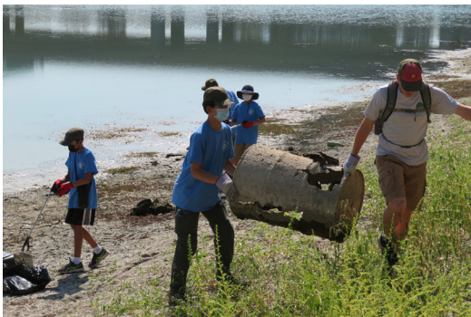
BSA Troop 286 clear large debris from the edge of the percolation ponds along Guadalupe River during their cleanup on October 3, 2021.