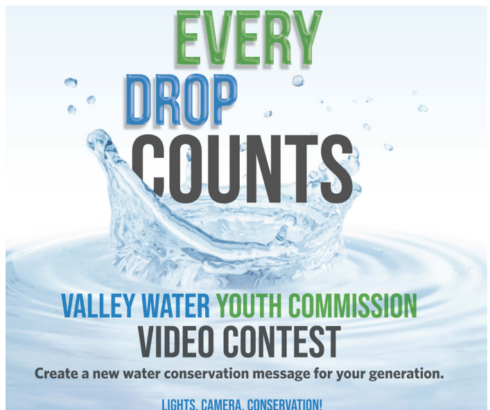
Youth Commission Video Contest Flyer.

In March, the Youth Commission successfully launched its first video contest for middle and high school students, focused on water conservation. The initiative encourages students to showcase their creativity while promoting stewardship of this critical resource. Participants have been invited to produce 20-60 second videos that deliver a fresh, youth-driven message aimed at motivating their peers to take action. The contest will recognize the top three submissions in both the middle and high school categories. The submission deadline is April 23 at 5:00 p.m.