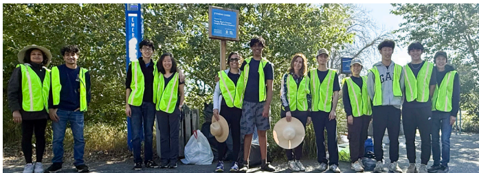
Teen volunteers and their mothers with the Young Men's Service League help clean Stevens Creek in Mountain View.