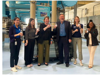
Staffers from the Office of Congressman Ro Khanna toast to purified water after a tour of the SVAWPC.

In March, staff hosted 12 tours of the Silicon Valley Advanced Water Purification Center (SVAWPC). Attendees included students, industry proponents, local government, and other members of the public. Staff collaborated with internal units to provide purified water programming for Valley Water staff. High school interns from Valley Water's NextGen Career Pathways visited the SVAWPC and completed The Water We Share activity. Staff partnered with the Asian Pacific Resources Group, Indo-American Association, and Women of Water, to provide purified water beverages and education at their Asian New Year and Women's History Month events. Additionally, staff attended the 2026 WaterReuse Symposium