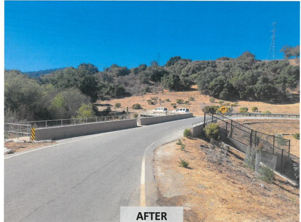
South Basin Control Structure