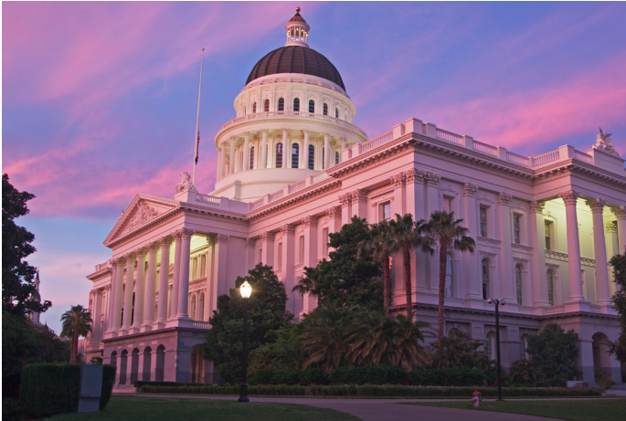
California State Capitol