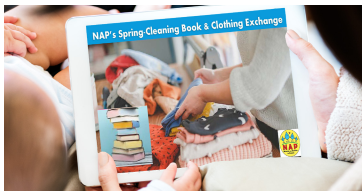
The Network and Activities for Parents (NAP) Book and Clothing Exchange Flyer.

NAP hosted a book and clothing exchange on Thursday, April 28 and celebrated spring-cleaning techniques in which staff exchanged goods at no cost. The timely event occurred after the Green Team’s Earth Day event that promoted the reuse and upcycling of items to reduce waste. This event was also an opportunity for staff raising young children to obtain and trade new clothes for their growing children.