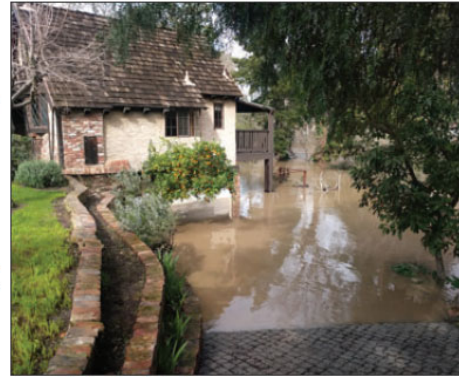
Driveway flooding.

Managing whole watersheds, with an eye for One Water integration, will be critical in creating the kind of flexibility and resilience in water resources management necessary to mitigate and adapt to uncertainties and unforeseen impacts. Climate change is important across all business areas for Valley Water and so is addressed by functional areas within its attributes and metrics.