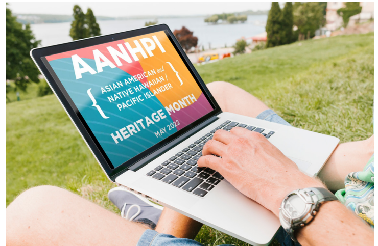
Town Hall AANHPI presentation by APRG.

The Asian Pacific Resource Group (APRG) led an educational presentation in honor of AANHPI Heritage Month during the May 12, town hall meeting. Valley Water employees learned about the history, contributions, and ways to celebrate and support the AANHPI community. In addition, a moment of silence was observed in remembrance of former Secretary of Transportation Norman Y. Mineta, who passed on May 3, at the age of 90.