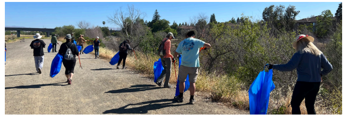
Volunteers from Saved by Nature begin their cleanup at the Sanchez Ponds Environmental Cleanup Site.