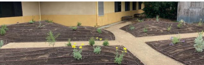
The space is now a native habitat and edible garden for the elementary school students.