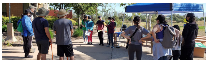
Youth Commissioners give safety instructions to National River Cleanup Day volunteers at the Valley Water Headquarters cleanup site.