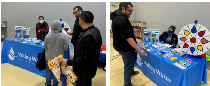
Valley Water OLA members share flood preparedness resources at the Santa Visits Alviso event to help attendees "Get Flood Ready".

CRS staff partnered with the Office of Government Relations and the Organizational for Latino Affairs (OLA) to provide emergency starter kits, English and Spanish flood preparedness information, and giveaways at the Santa Visits Alviso event held on December 10.