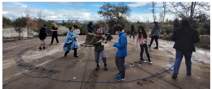
Discovery Charter School students learn about the water cycle at the Alamos outdoor classroom.

FY23 Goal: Reach at least 10,000 students and 500 members of the public.