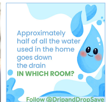
In Ani & Cat's video, Drip and Drop discuss how they can save water (left); Sample water conservation trivia post for use on social media (right).

Valley Water Refill Station Grant Program: Valley Water awarded two refill stations for a total of $10,000 to: