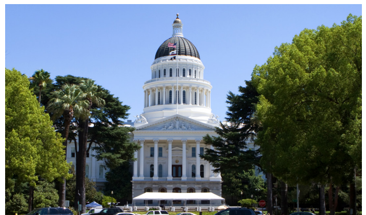
California State Capitol in Sacramento.

Staff will be advocating through the state budget process for Valley Water's funding priorities, including dam safety, recycled water, and State Flood Control Subventions funding.