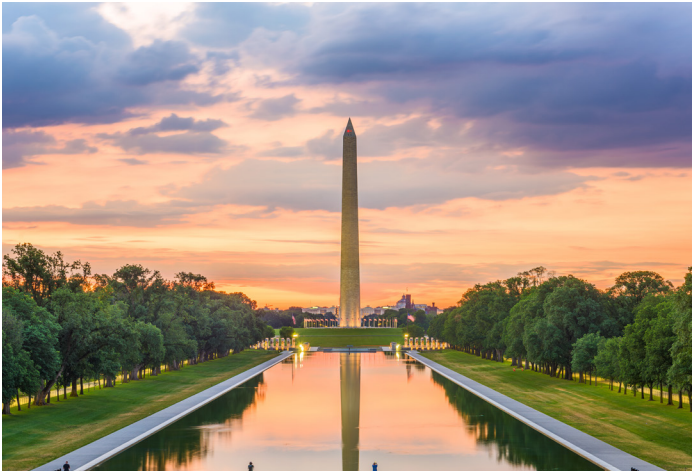
Washington Monument on the Reflecting Pool in Washington, DC.