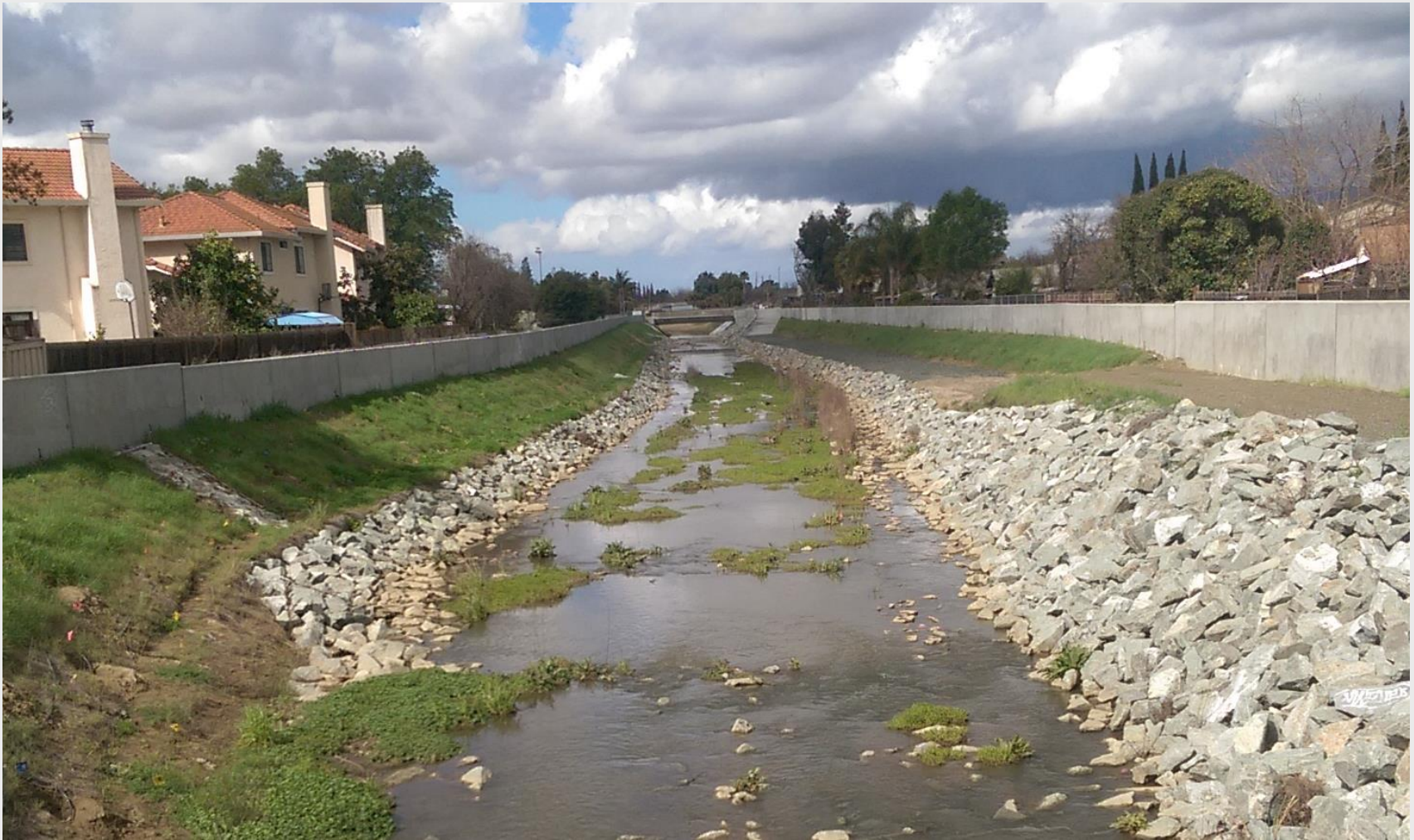
Looking downstream from Cunningham Avenue