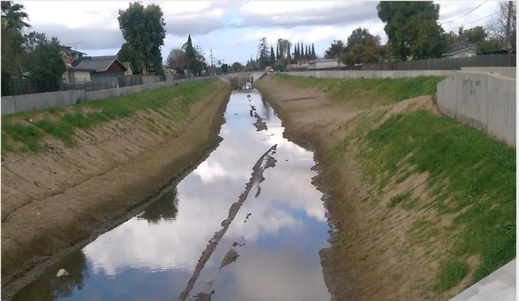
Looking downstream from Ocala Avenue