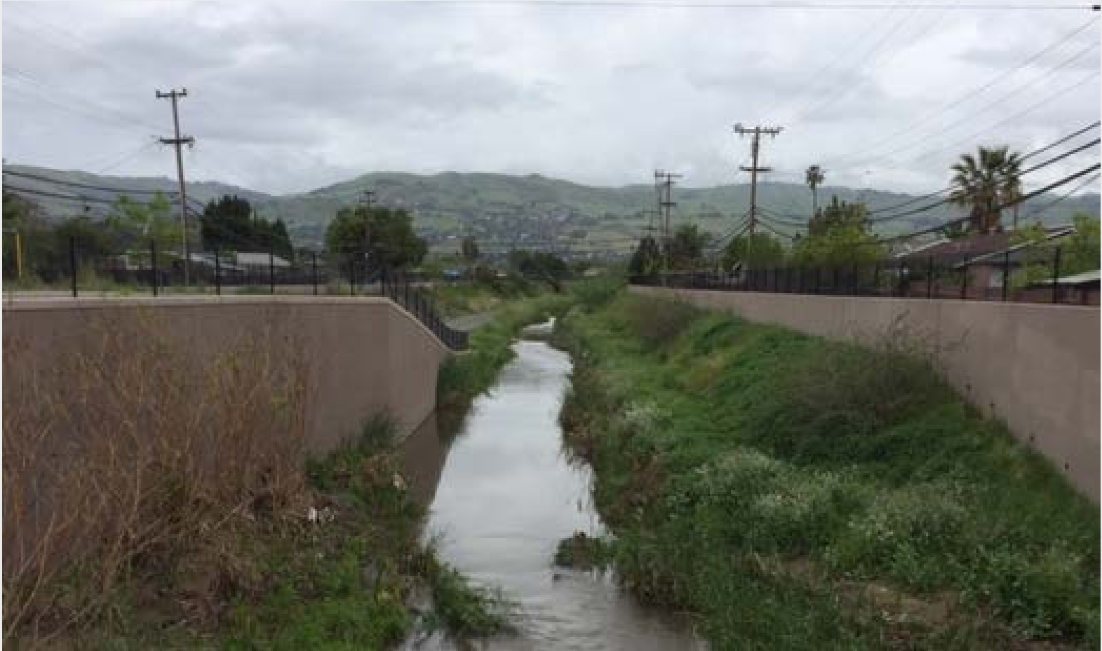
Lower Silver Creek Looking upstream from Jackson Avenue