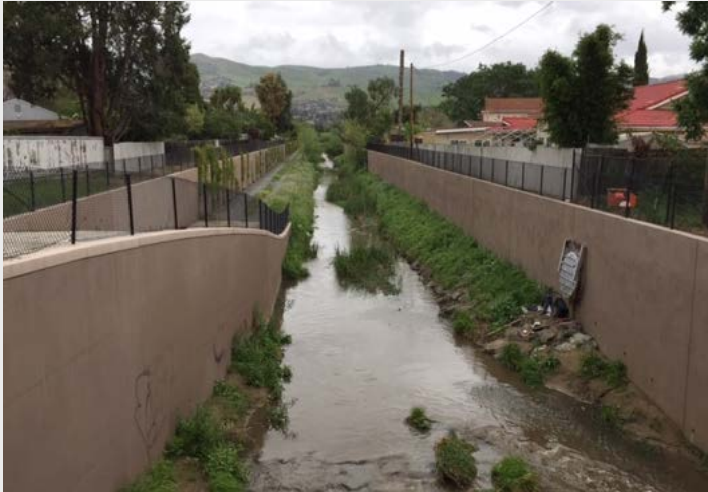
Lower Silver Creek Looking upstream From Capitol Expressway