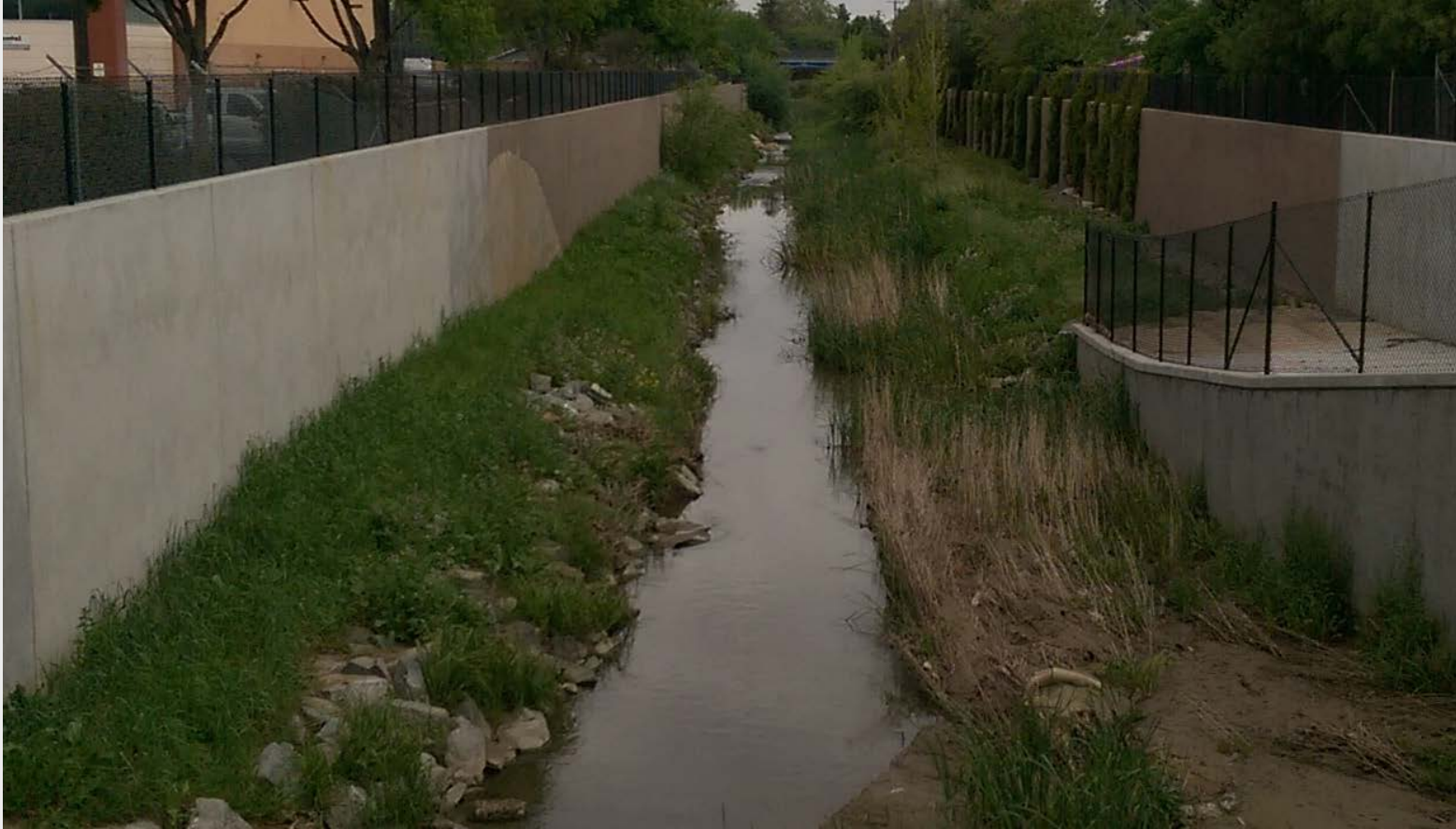
Lower Silver Creek Looking downstream From Story Road