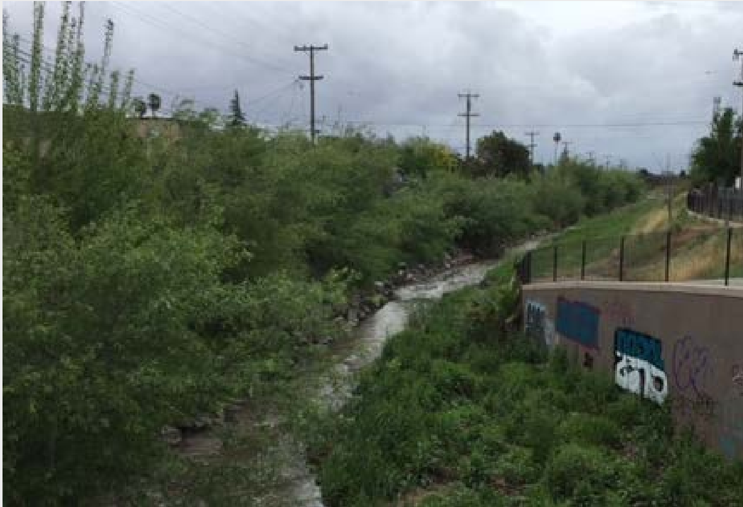
Lower Silver Creek Looking downstream From Capitol Expy