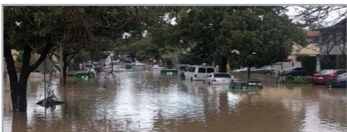
Rock Springs neighborhood, February 21, 2017 Coyote Creek flood event