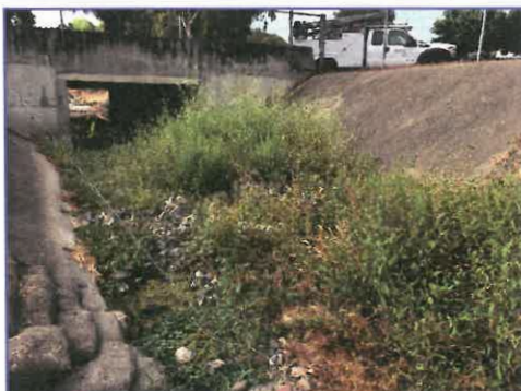
Randol Creek, downstream of Bret Harte Drive: Before and After