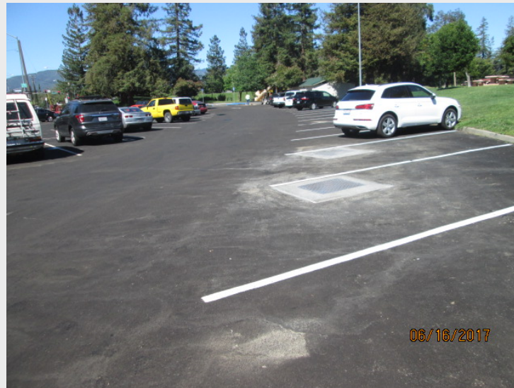
Well Vault and Final Condition