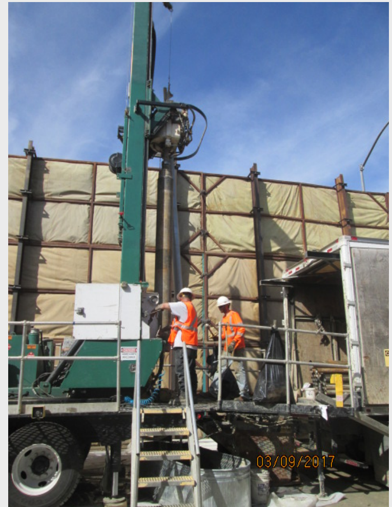
Well Drilling Operation