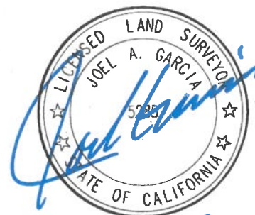
EXHIBIT A PLAT TO ACCOMPANY LEGAL DESCRIPTION