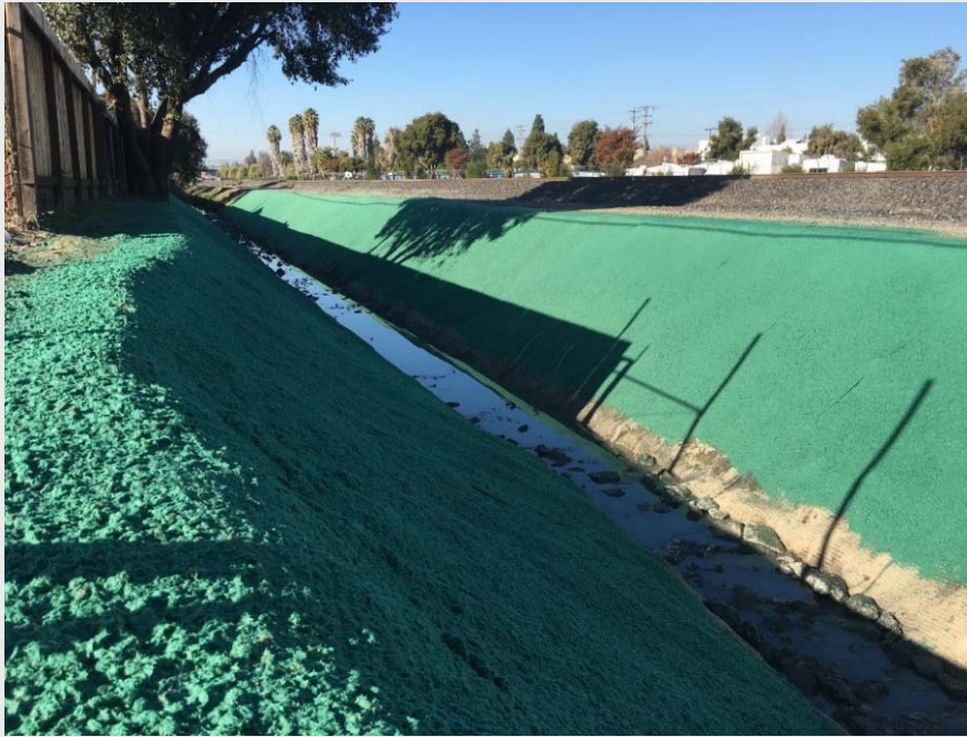
El Camino Storm Drain Erosion Repair Project