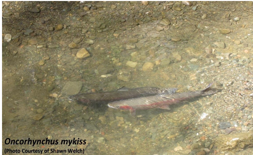
Oncorhynchus mykiss

Prepared for the EWRC Meeting October 15, 2018