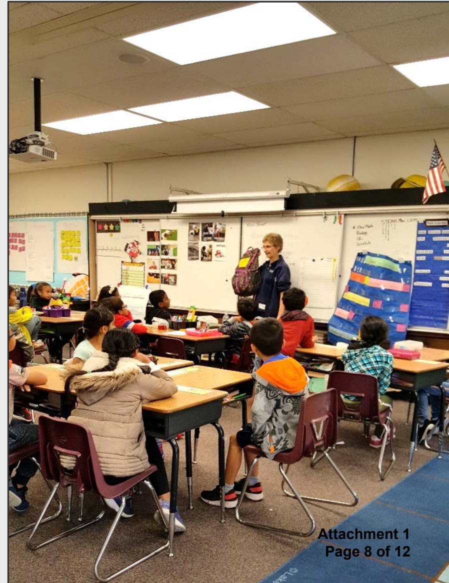
Attachment 1 Page 8 of 12