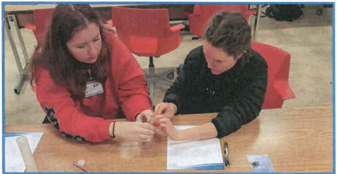
SJSU STEM for Girls event with Women of Water (WOW) & Society of Women Engineers.