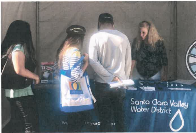
June 2: Valley Water staff at Sunnyvale Art & Wine Festival