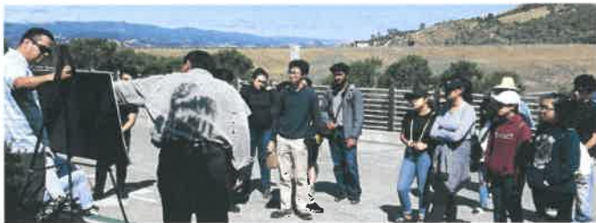
Yerba Buena High School students tour Almaden Dam.