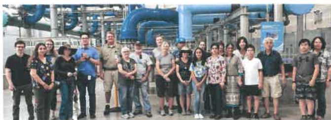
Attendees learn about purified water during a public tour of the Silicon Valley Advanced Water Purification Center.