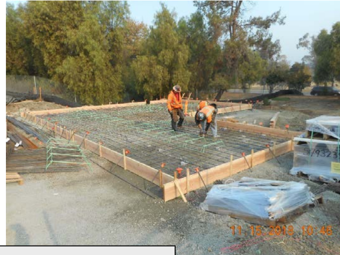
New Trash Compactor Area