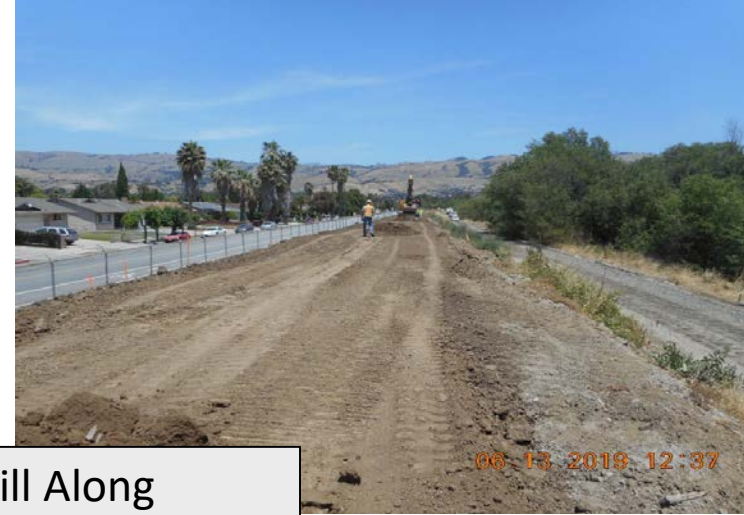
Levee Fill Along Cunningham Ave.