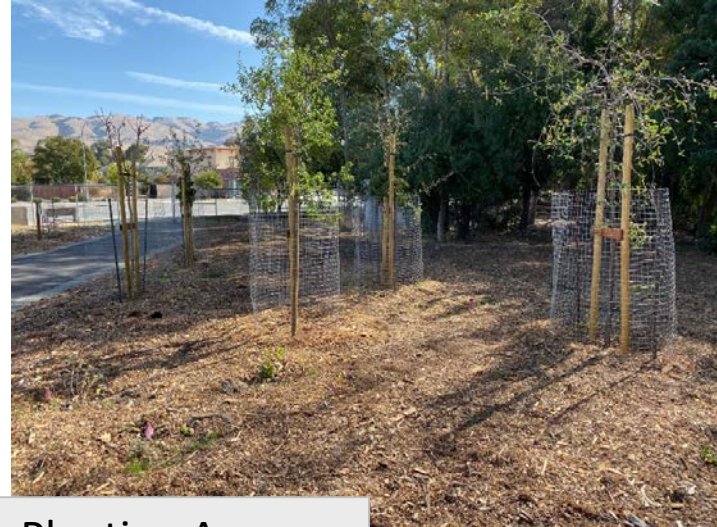
Final Mitigation Planting Area