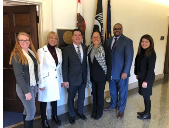
Washington, D.C. Trips: April 1-3, November 12-14