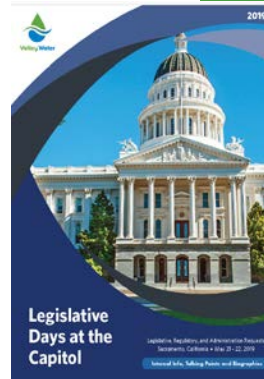
State Legislative Days: May 21-22