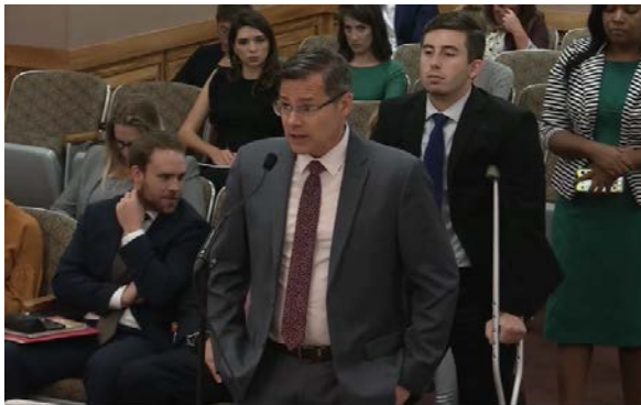
SB 268 (Wiener) Ballot Labels: Local Taxes