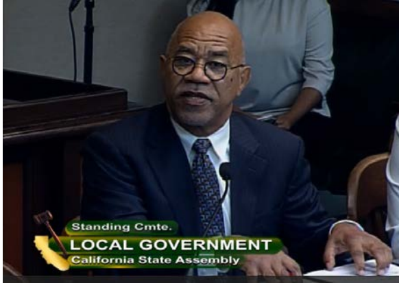
AB 707 (Kalra) Valley Water Contracting Threshold