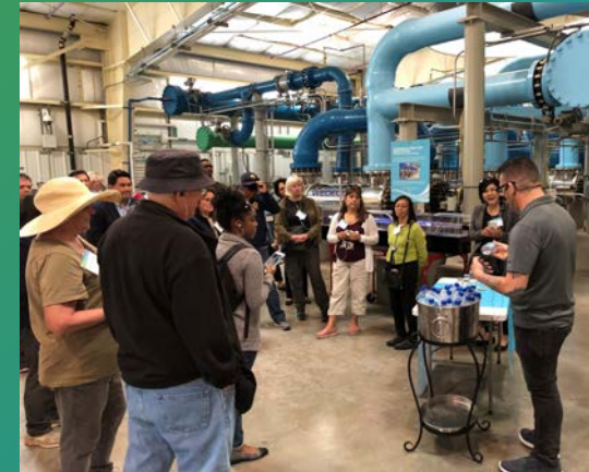
VIP Water Walk Tour