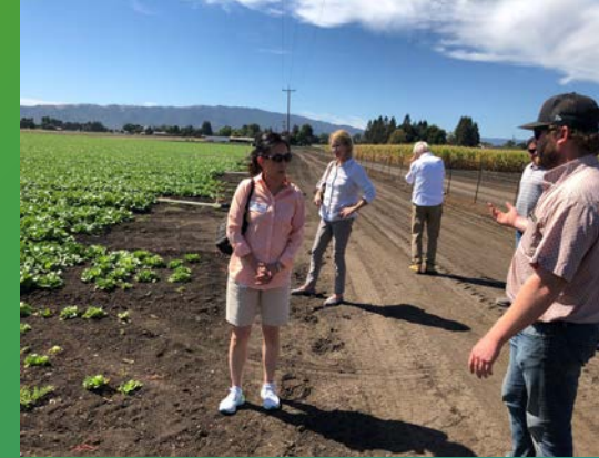
Farm Bureau Tour