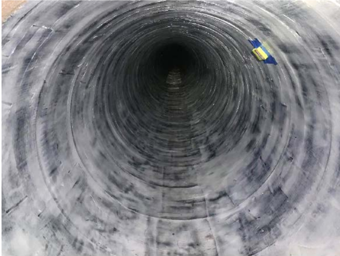
Repaired Pipe Section