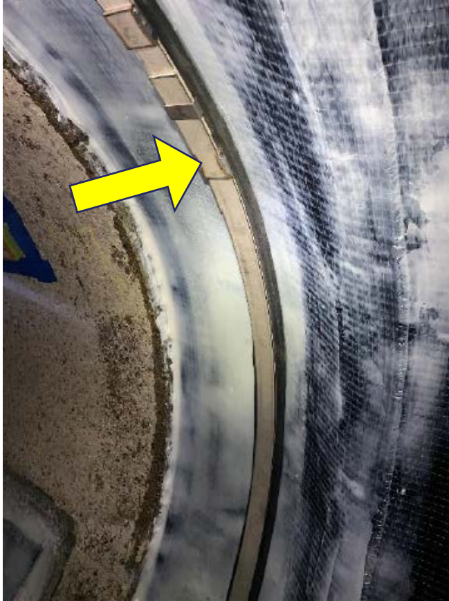
Termination ring at joint of repaired pipe