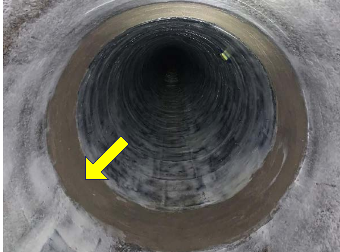
Epoxy mortar covering termination ring