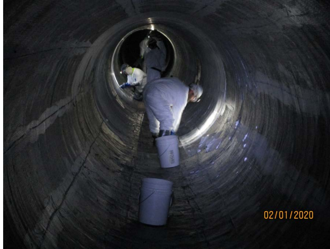
Installation of Carbon Fiber and Thickened Epoxy