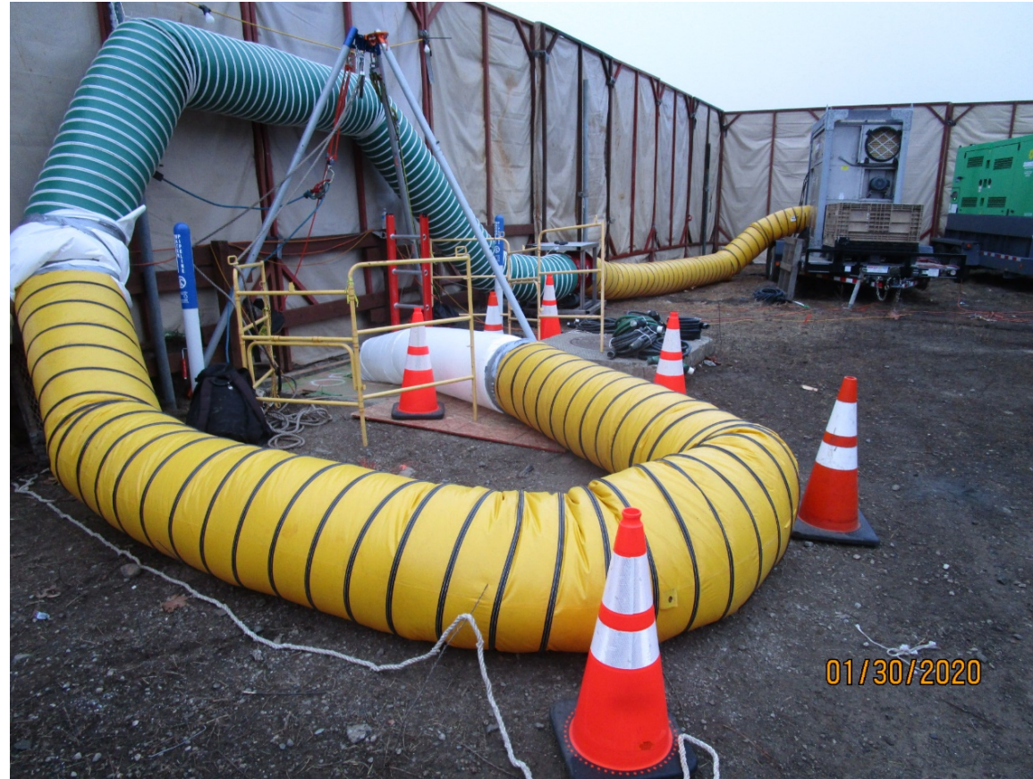
Dehumidifier and heater for installation of carbon fiber.