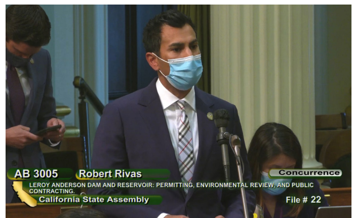
Assemblymember Robert R. Rivas presenting AB 3005 on the Assembly Floor for concurrence in Senate Amendments

Other bills supported by Valley Water and passed by the Legislature include ACA 5 Proposition 209 Repeal, AB 2560 Water Quality Notifications, and SB 1044 PFAS Phase Out in Firefighting Foam & Equipment. A complete list of bill positions and outcomes is attached.