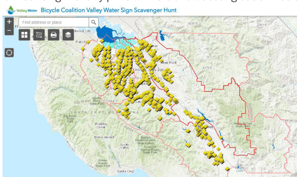
Participants of the Great Sign Hunt have submitted 7000 Valley Water signs found across Santa Clara County.

Signage Inventory with Silicon Valley Bicycle Coalition (SVBC): Due to the poor air quality from the Bay Area wildfires, the Great Sign Hunt 2020 was extended by two weeks and will run through October 29. As of September 23, more than 340 participants are registered and more than 7,300 signs have been submitted, of which approximately 3,500 are unique signs (not duplicated). SVBC and Valley Water staff continue to promote the scavenger hunt by highlighting different watershed areas through blog posts and the event website, announcing monthly prize winners and boosting social media posts.