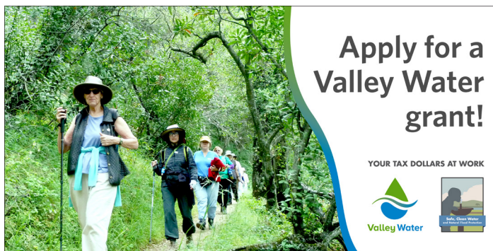
The 2021 grant cycle is open now through December 1.