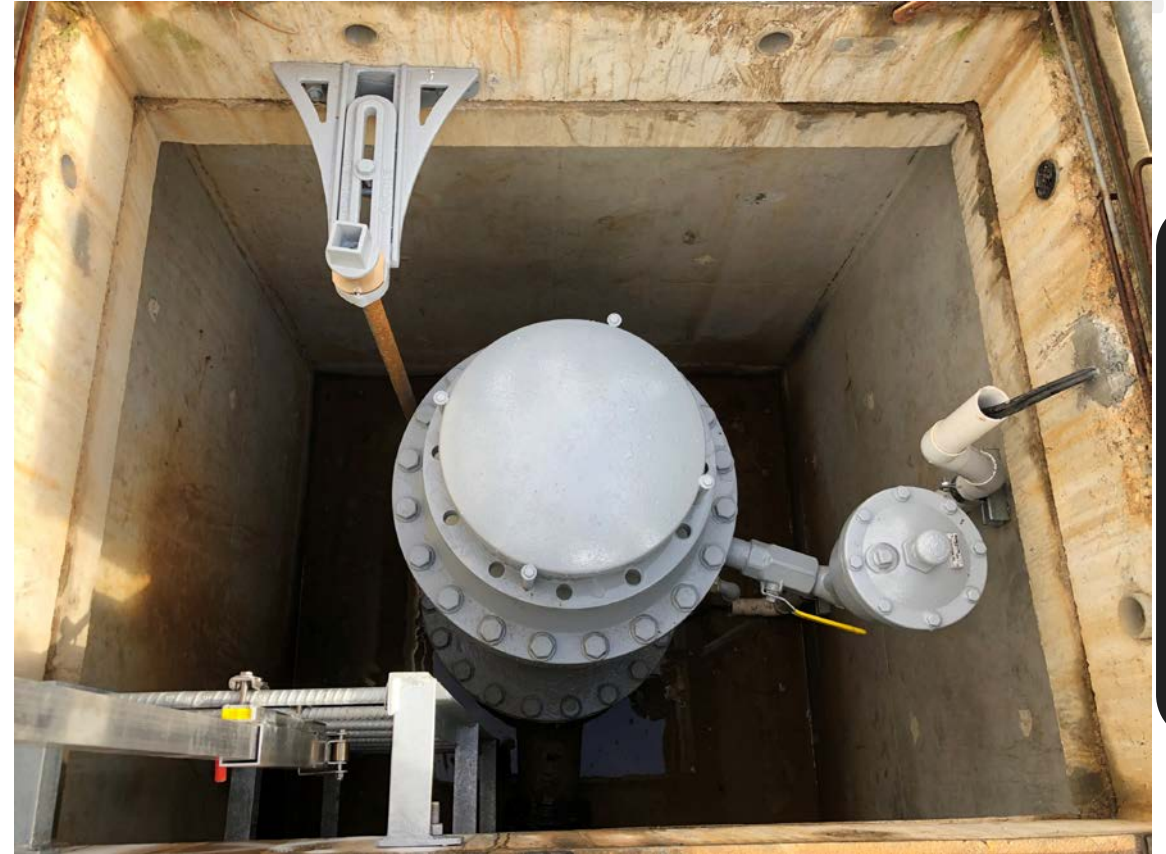
Appurtenance Vault Work – Before and After