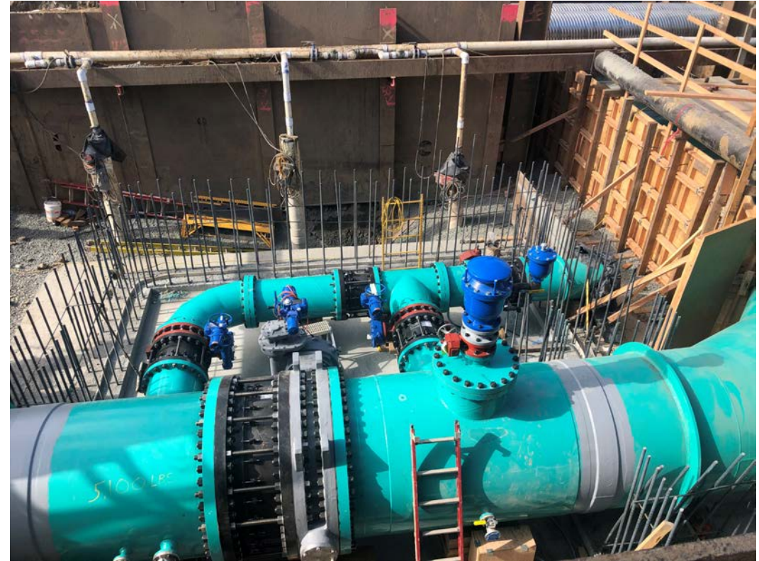
Cochrane Valve Vault Construction