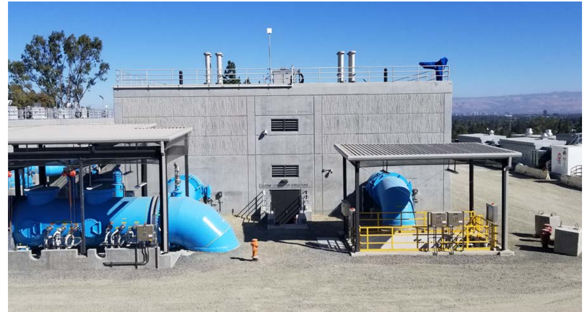
Ozone Contactor Structure