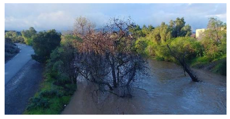
Federal Funding for Upper Guadalupe River Project Reevaluation