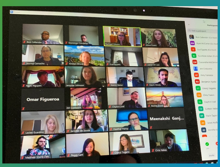
Safe, Clean Water Blue Ribbon Forum